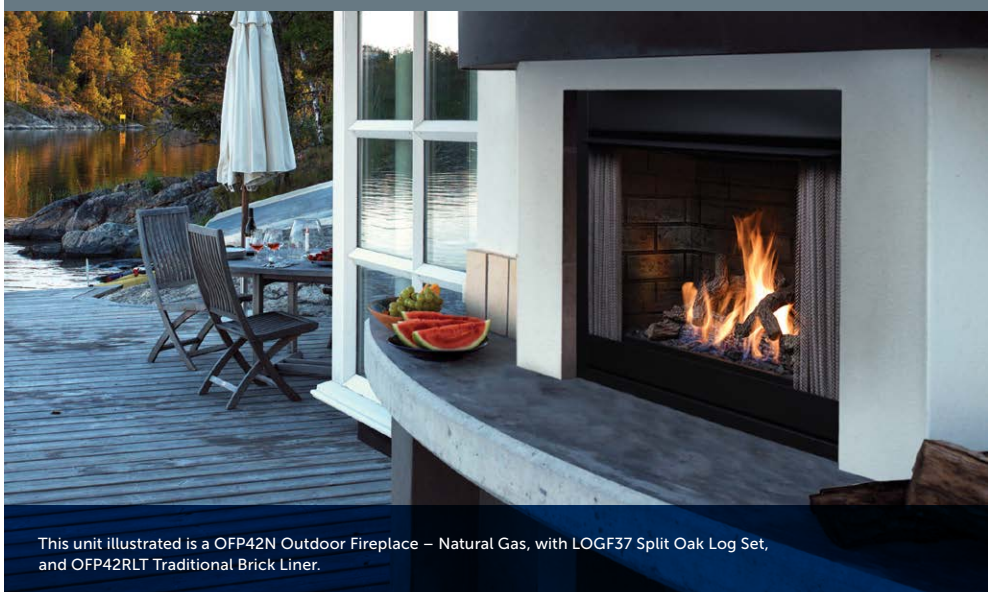
This unit illustrated is a OFP42N Outdoor Fireplace – Natural Gas, with LOGF37 Split Oak Log Set, and OFP42RLT Traditional Brick Liner.